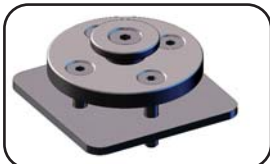
Deck fixing block

■ Easy fixation thanks to an automatic locking device on deck fixing blocks;