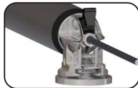
Integrated line stopper

■ Easy fixation thanks to an automatic locking device on deck fixing blocks;