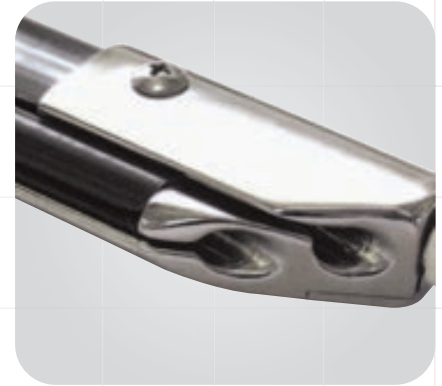
Twin grooves allow for easy sail changes

Stainless steel, snag-free feeder allows spinnaker sheets to pass freely