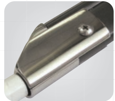
No snag, 2-piece S.S. captive feeder will not peel off