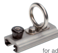
Spi eye for adjustment with piston

■ These are used to put the spi pole in position on the front side of the mast. Various types are available: fixed spi eyes, or on a track for adjustment, standard or reinforced, simple or with a piston.