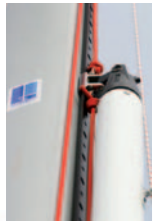
Stainless steel strap

Sparcraft can supply various systems to stow away the spi pole horizontally or vertically (with adjustment of the height).