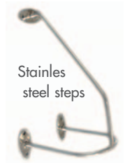
Stainless steel steps